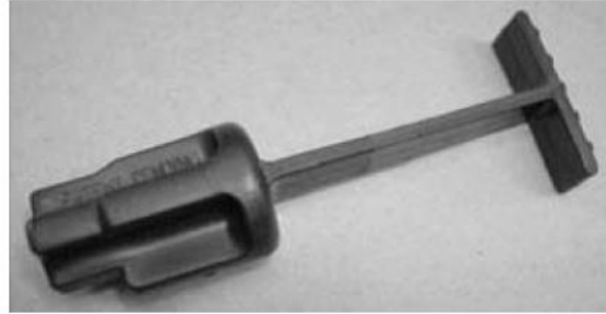
Quick Plug with Hook