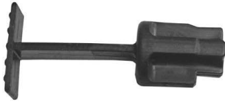
Quick Plug with T